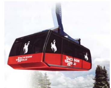
Brand New 100 Passenger Aerial Tram