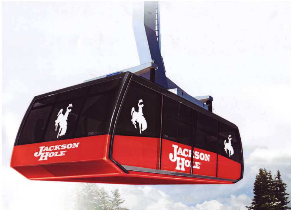
NEW 100 PASSENGER CABINS