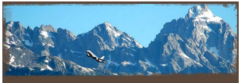
New Direct Non-Stop Frontier Airlines Service from Denver (DEN)