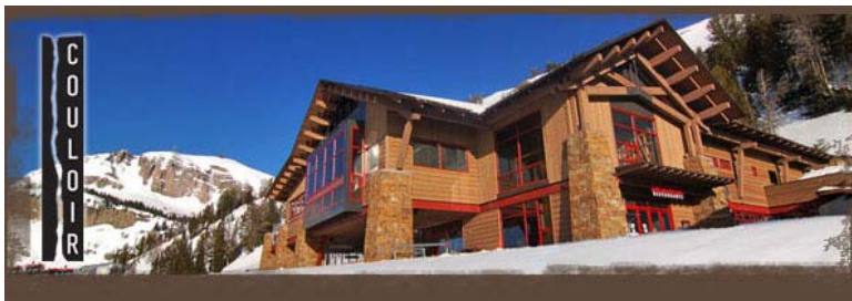
The New Bridger Restaurant at the summit of the Gondola! Couloir Restaurant, Headwall Deli, and a 150 seat Rendezvous Café.