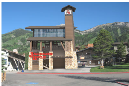
New Tram Base Terminal