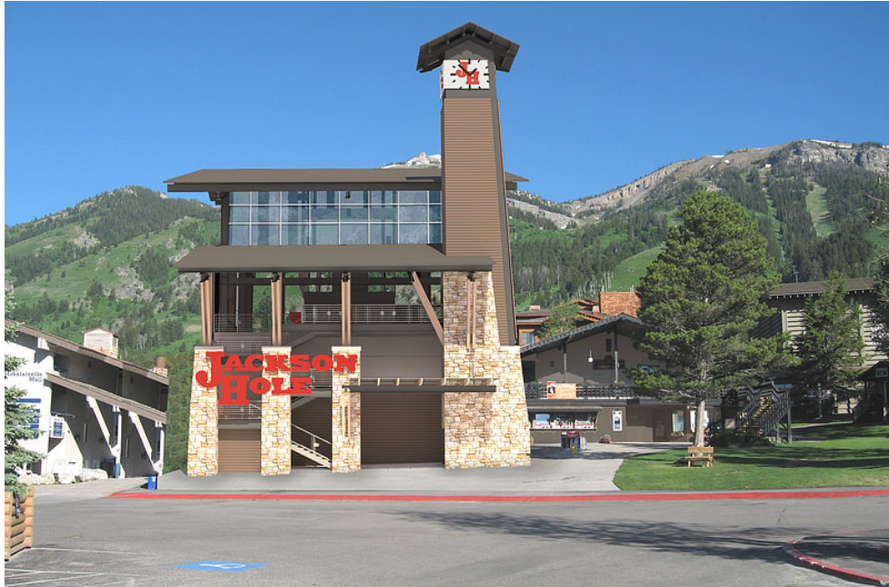
NEW BASE TERMINAL